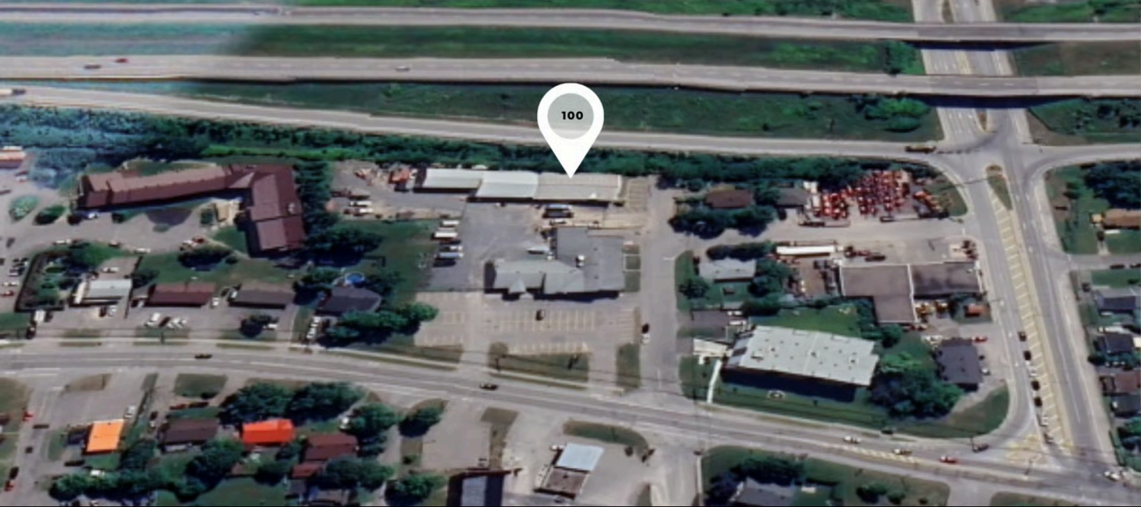
100 Yvon-Provost, Salaberry-de-Valleyfield