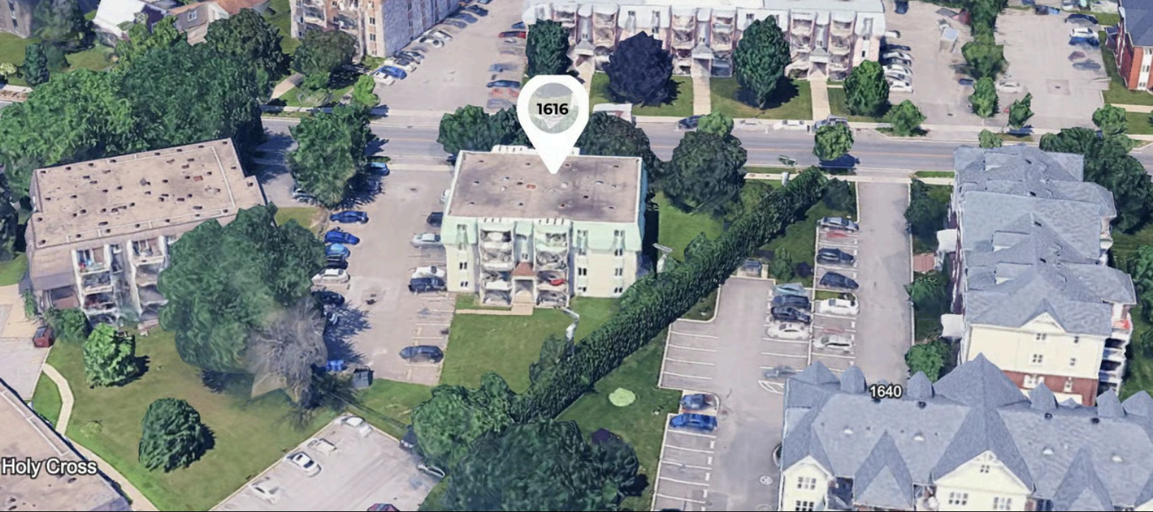
1616 Saint Charles, Terrebonne