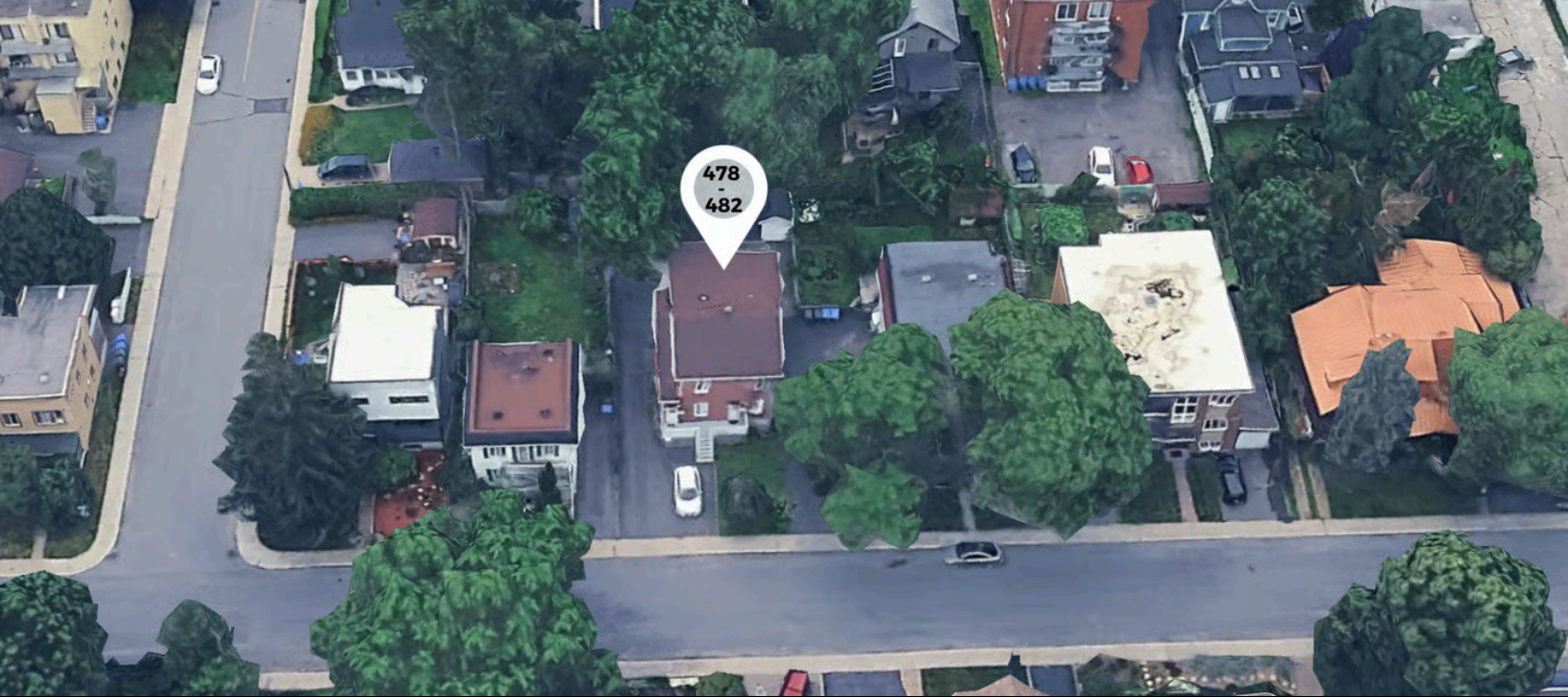
478 - 482 Duvernay, Longueuil